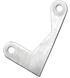
4600AR-C Jagg anti-rotation device